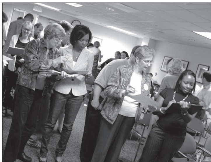
A scene from last year's forum on Inclusive Community Initiative.

The traffic circle will reopen today at 3 p.m. – after car crash demonstration. p 6