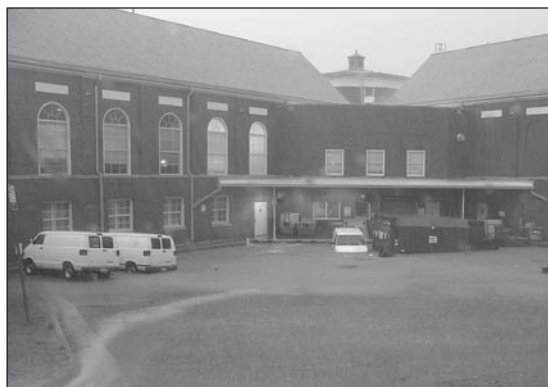
Rains flooded the loading dock at the Dining Hall.

Additionally, four residence halls had some water in the basements.