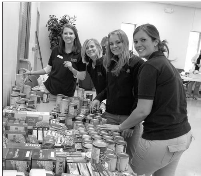
Nursing students organizing food items for the food pantry.